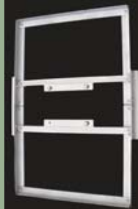
Wall & Tower Mount